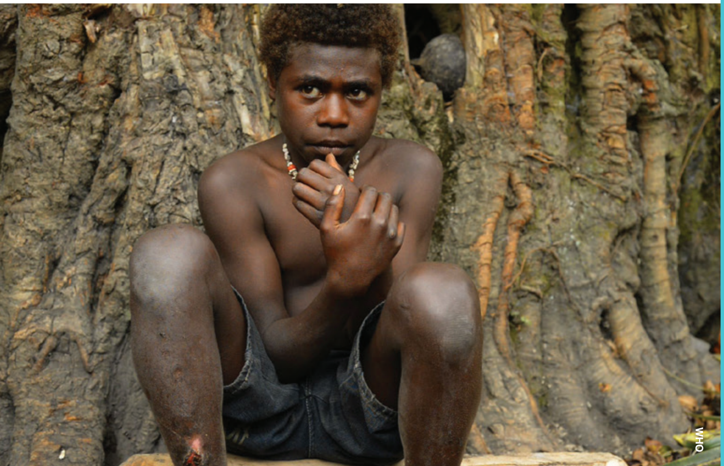
A yaws patient in Vanuatu.