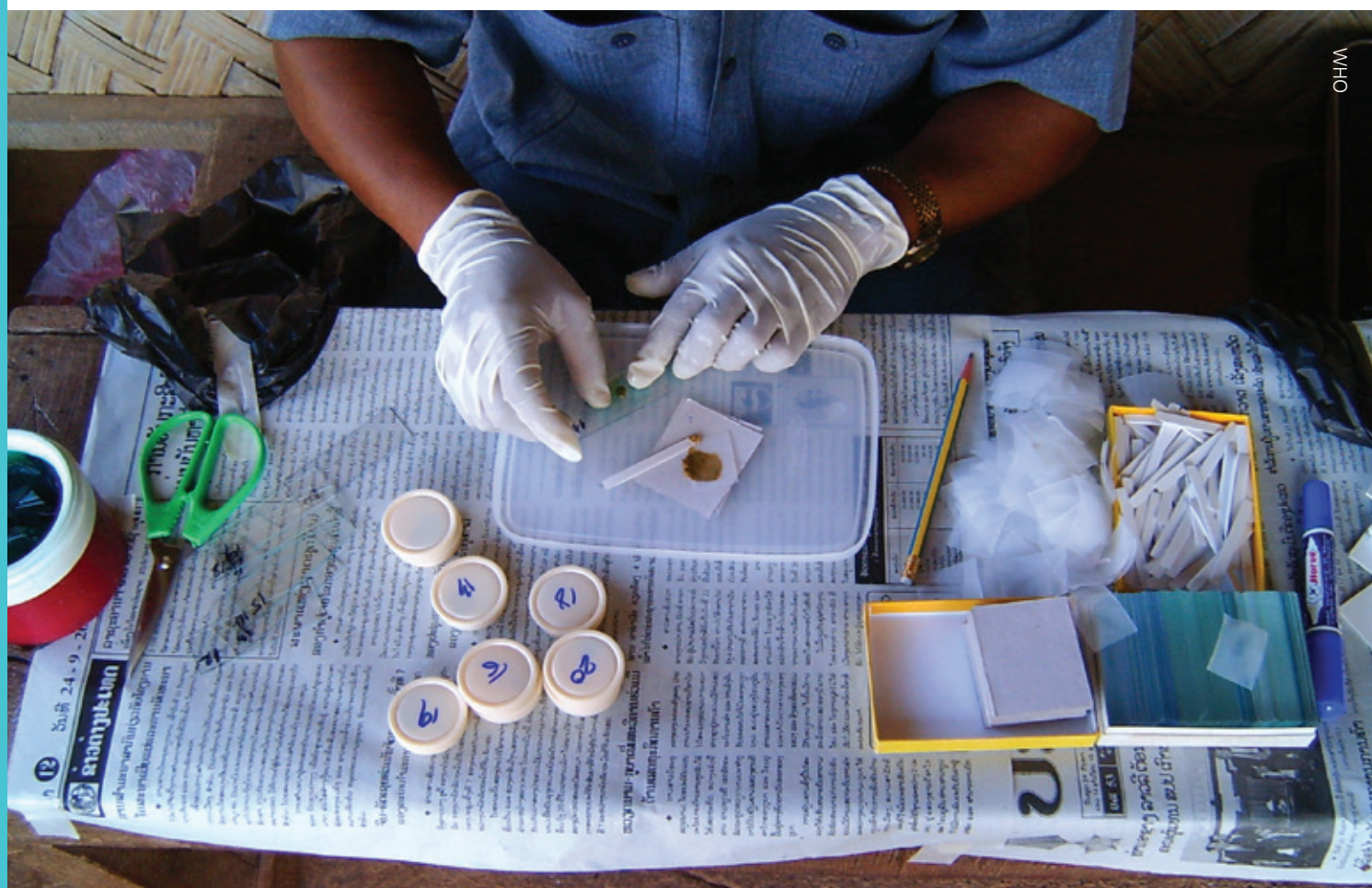
A health worker examining stool for helminthiasis in the Lao People's Democratic Republic.