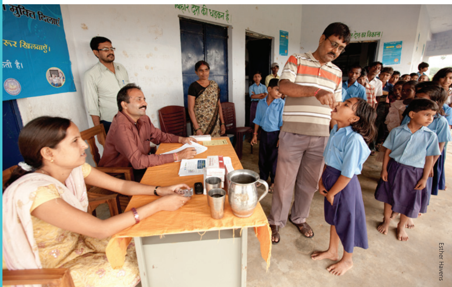
Students from Phulwari Sharif School in Bihar, India participate in a deworming programs.

However, governments of endemic countries and areas cannot meet their goals alone. Much of the progress in the Asia Pacific against NTDs in the past 10 years has been accomplished as a result of the continued support of valued partners from the private sector (especially pharmaceutical companies making drug donations), bilateral and international agencies, academic institutions and nongovernmental organizations.