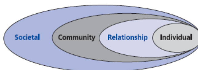
Ecological model for understanding violence

Elder abuse is “a single or repeated act, or lack of appropriate action, occurring within any relationship where there is an expectation of trust that causes harm or distress to an older person. Elder abuse includes physical, sexual, psychological, emotional, financial and material abuse; abandonment; neglect; and serious loss of dignity and respect” 5 .