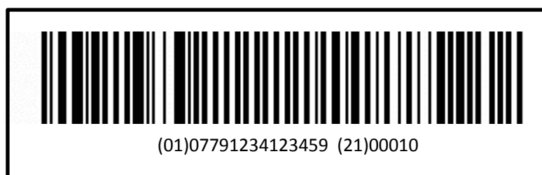
Figure 1: Linear barcode example