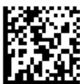
Figure 2: 2D Data Matrix barcode example