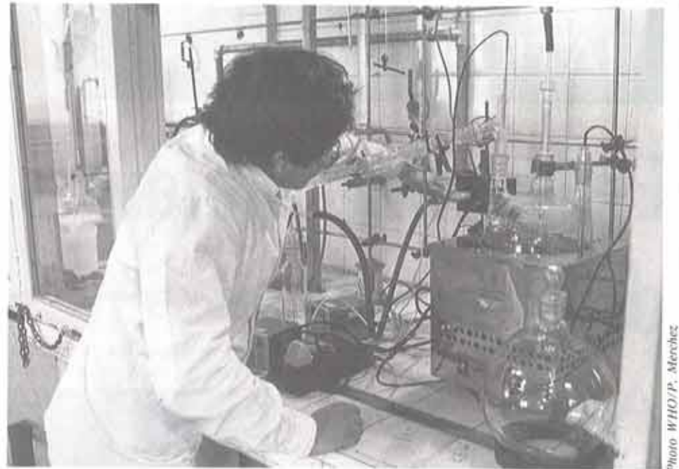
The Eastern Caribbean Drug Service also assists members with quality control, especially through selection and monitoring of suppliers.

The Tenders Sub-committee also assists the Formulary and Therapeutics Sub-committee, comprised of senior physicians from each island, who have been appointed by their respective ministries. The Formulary and Therapeutics Sub-committee is responsible for both the regional and country formulary process, including the development and publication of a regional formulary and therapeutics manuals that can be used as a reference tool by physicians, pharmacists and other health care workers.