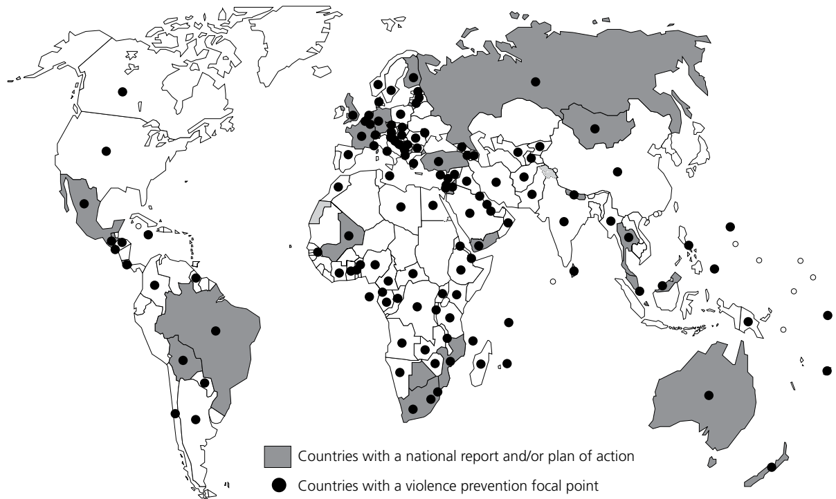
Figure 2.1 Countries that have launched the World report on violence and health and have a designated violence prevention focal person

This map is for illustrative purposes and does not imply the expression of any opinion of the authors or WHO concerning the legal status of any country or territory or concerning the delineation of frontiers or boundaries.