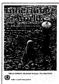
Inheriting the World: The Atlas of Children's Health and the Environment