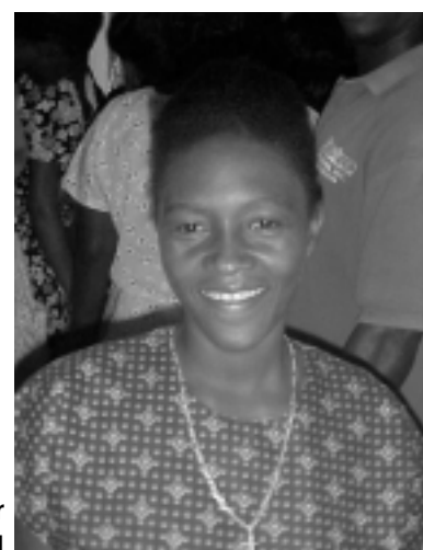
Fig. 3. Adeline after ARV therapy was initiated