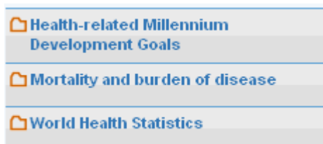
Figure 3: Sample left navigation for the Database section

The appearance of the left navigation depends on which section of the GHO is highlighted, i.e., in white text with an orange background.