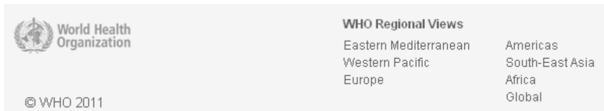
Figure 5: The Footer filters the Database by WHO Region

The footer enables filtering the GHO database for only the countries under the selected WHO Region.