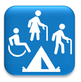
11. Vulnerable and marginalized populations (NEW)