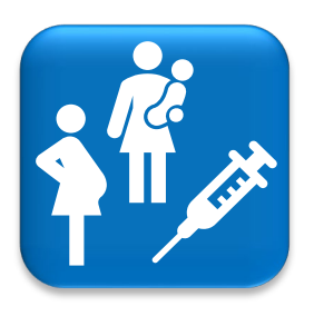
9. Strengthening essential health services