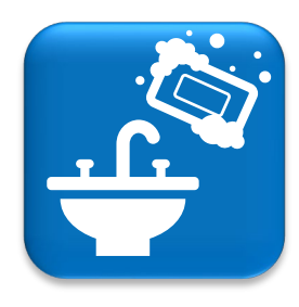
6. Infection prevention and control