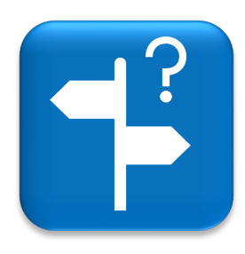
14. Other possible topics and cross-cutting issues