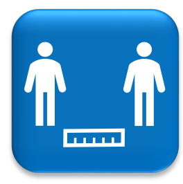
13. Public health and social measures (NEW)