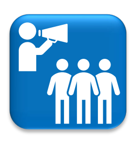
2. Risk communication, community engagement and infodemic management