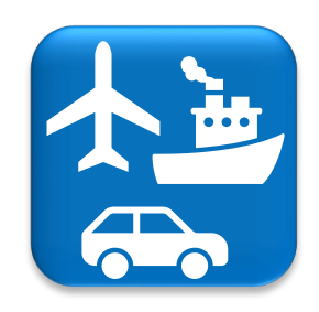
4. Points of entry