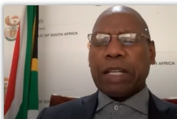
Minister of Health South Africa