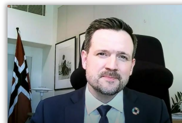
Minister of International Development, Norway