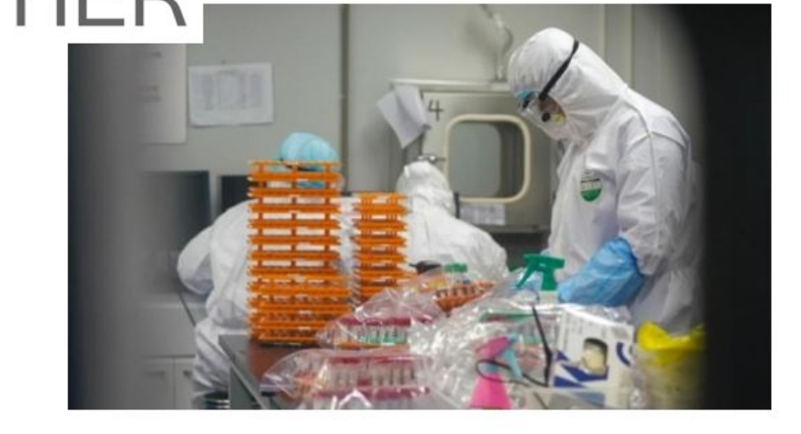
Department of Regulation and Prequalification, WHO